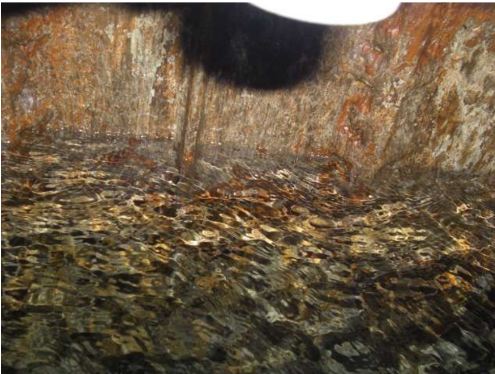
These photographs show the internal surfaces of the tank prior to relining work commencing.