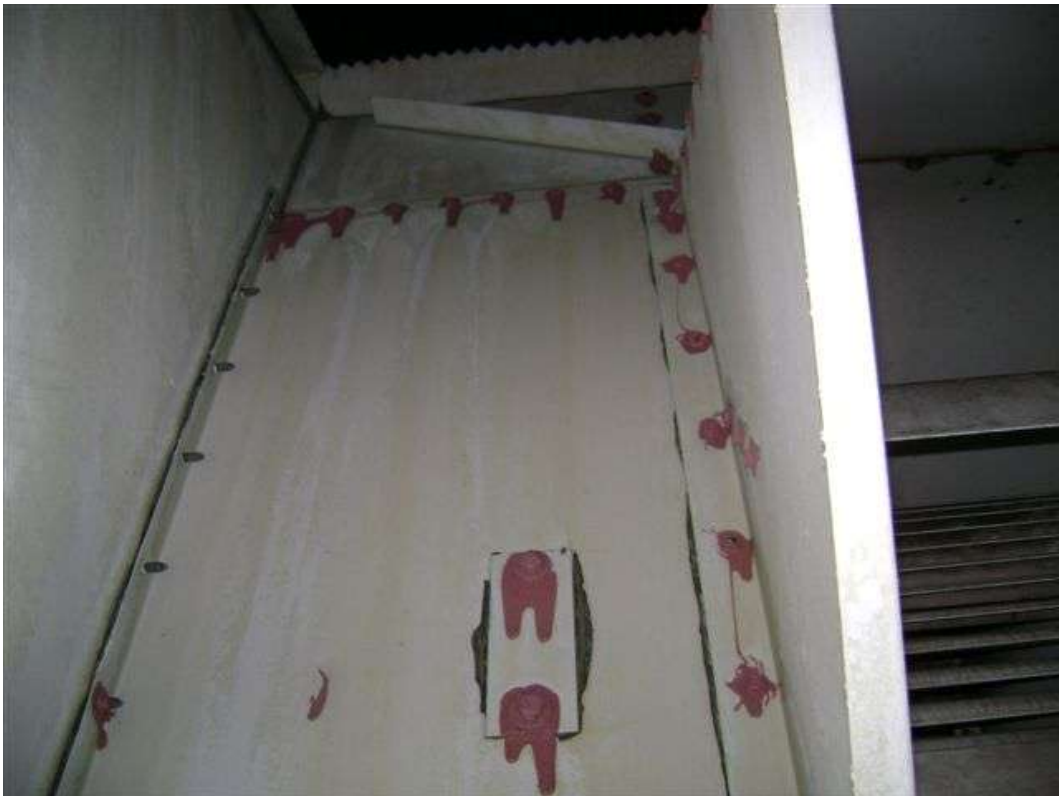
These photographs show the internal substrate of Cooling Tower # 1 prior to relining work commencing.