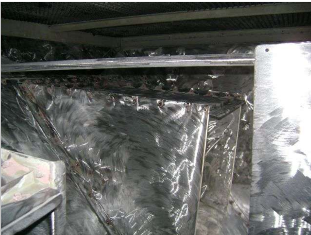
These pictures show the Cooling Tower following preparation by COVAC Operatives, in accordance with ISO 8501-1:2007, utilizing mechanical power tools and manual tools.