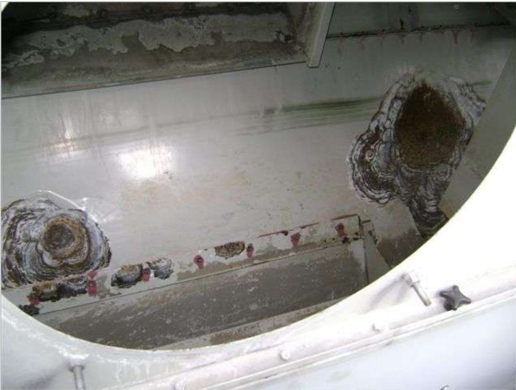
These photographs show the internal surfaces of Cooling Tower # 2 prior to any work commencing showing signs of failure to the current epoxy coating.