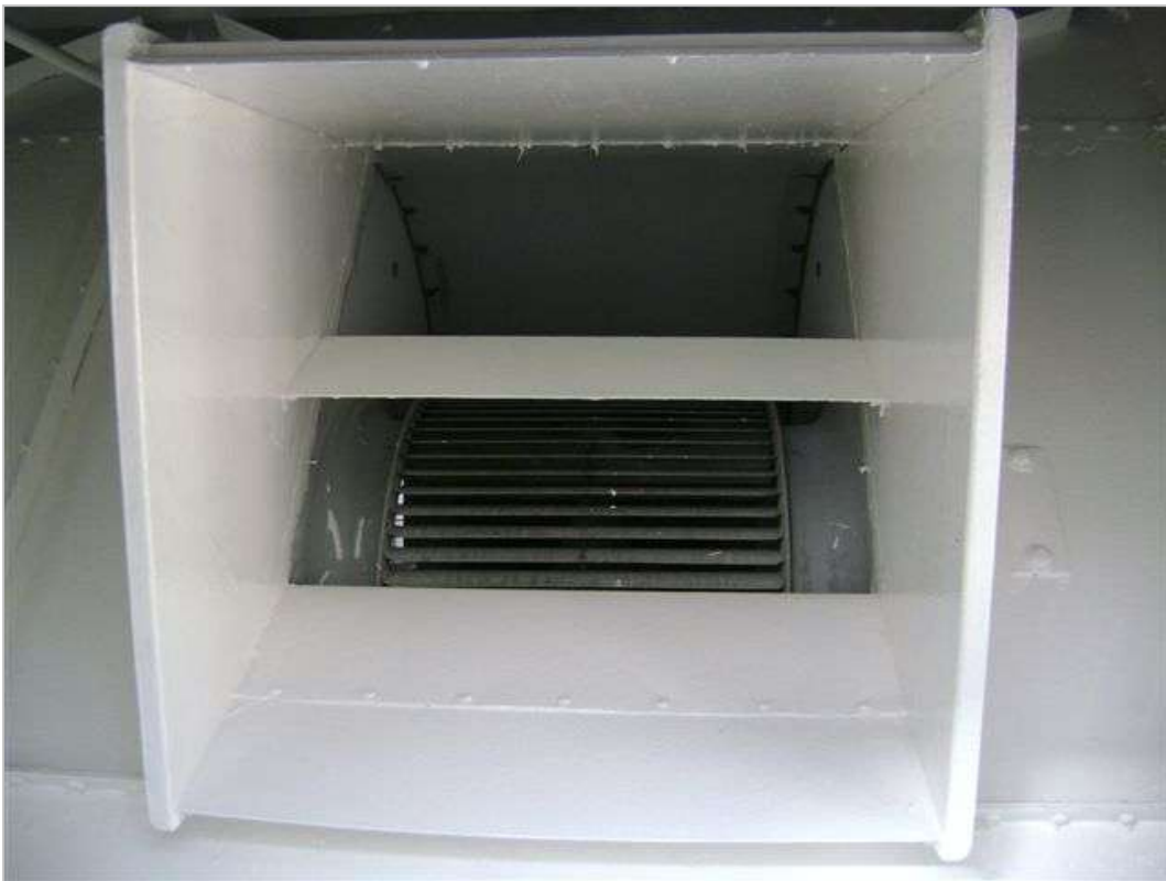
All seams, joints, bolts etc were initially 'stripe coated' and the following photographs show the substrate having been coated with the 1 st full coat of 3M Scotchkote™ 165PW (cream) Solvent Free Polyurethane, by means of brush and roller to a nominal wet / dry film thickness of 500 Microns.