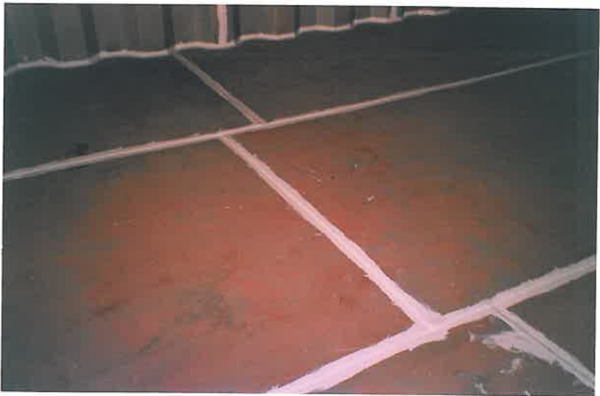
All weld seams, joints and flanges etc, were firstly stripe coated prior to a full coat application.